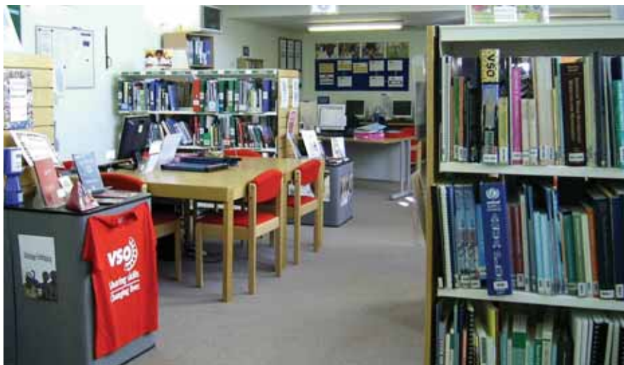
The library at the Birmingham Training and Resource Centre is open 24 hours a day.

The London Resource Centre logs project reports six months into the placement and also the final report when the volunteer completes their placement. These are indexed according to country and profession.