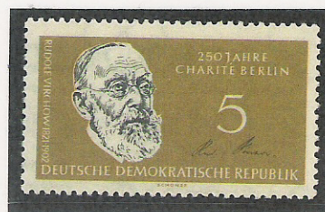
RUDOLF VIRCHOW (1821 – 1902) PATHOLOGIST

VIRCHOW DESCRIBED THE PATHOLOGY OF SYPHILIS AND SHOWED THAT IT AFFECTED ALL ORGANS OF THE BODY. HE SUGGESTED THAT THE CAUSATIVE ORGANISM WAS CARRIED VIA THE BLOOD TO INFECT ALL PARTS OF THE BODY