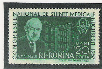
GEOGES MARINESCU (1863 – 1938) ROMANIAN NEUROLOGIST CONFIRMED NOGUCHI'S DISCOVERY