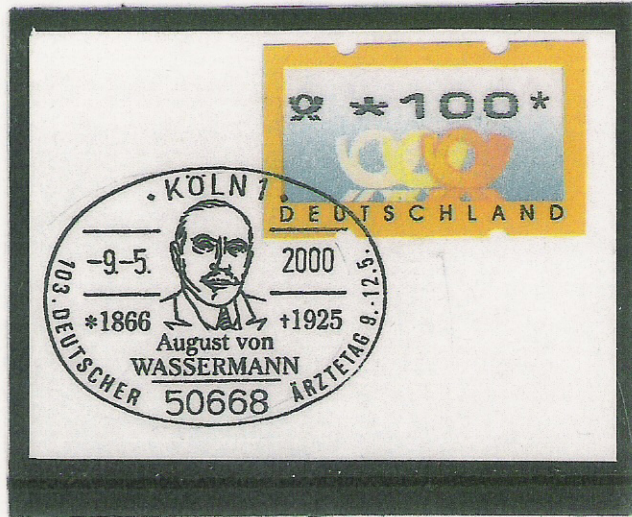
AUGUSTUS von WASSERMAN (1866 – 1925)

IN 1906 WASSERMAN, NEISSER & BRUCK DESCRIBED A COMPLEMENT FIXATION REACTION USING AN AQUEOUS EXTRACT OF FOETAL SYPHILITIC LIVER AS ANTIGEN